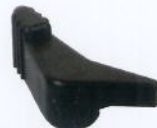
操作手柄 Handle 编号/Code: SH-P 图号NO.: NF8.333.004