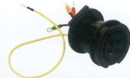
绝缘座块 Socket Interior 编号/Code: S32A-4 图号NO.: NF6.604.006