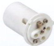
绝缘座块 Socket Interior 编号/Code: S32A-2 图号NO.: