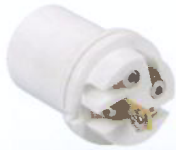
绝缘座块 Socket Interior 编号/Code: S32A-1 图号NO.: NF6.670.056