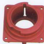
绝缘座块 Socket Interior 编号/Code: S32A/6 图号NO.: NF8.074.000