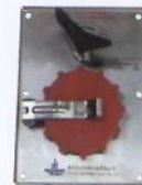
插座面板 Socket Panel 编号/Code: S32A-P 图号NO.: NF5.568.002