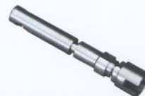
手柄轴 Handle Axle 编号/Code: LW-A 图号NO.: NF8.300.004