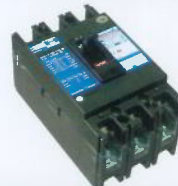
塑壳断路器 Circuit Breaker 编号/Code: XS50NB 图号NO.: