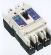
塑壳断路器 Circuit Breaker 编号/Code: NF63-CW / HW 图号NO.: