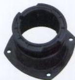
绝缘座块 Socket Interior 编号/Code: S32A-5/5 图号NO.: NF8.074.004