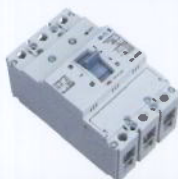
塑壳断路器 Circuit Breaker 编号/Code: BZMD1 图号NO.: