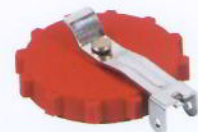
插座端盖 Bayonet Cap 编号/Code: DC-P 图号NO.: NF6.171.003