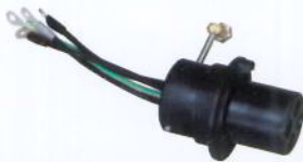
绝缘座块 Socket Interior 编号/Code: S32A-5 图号NO.: NF6.670.004