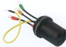
绝缘座块 Socket Interior 编号/Code: S32A-3 图号NO.: NF6.670.000