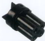
绝缘座块 Socket Interior 编号/Code: C32A 图号NO.: NF6.670.012